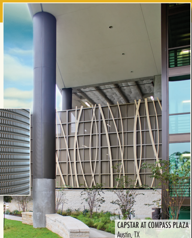
CAPSTAR AT COMPASS PLAZA Austin, TX