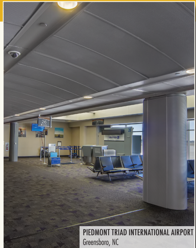
PIEDMONT TRIAD INTERNATIONAL AIRPORT Greensboro, NC