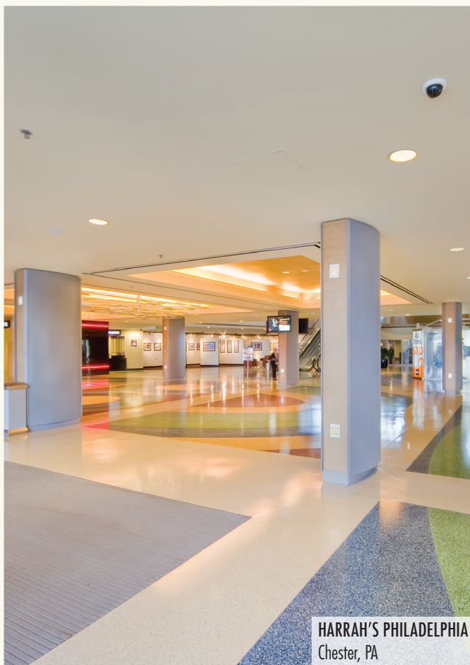
HARRAH'S PHILADELPHIA Chester, PA