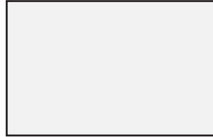
AIRBAR WHITE VX-0208 GLOSS 10 +/- 5 LIGHT REFLECTANCE 88