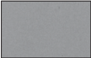
SILVER SATIN VX-747 GLOSS 40 +/- 5 LIGHT REFLECTANCE 72