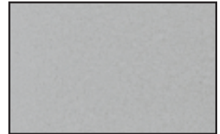
BRIGHT SILVER VX-824 GLOSS 10 +/- 5 LIGHT REFLECTANCE 79