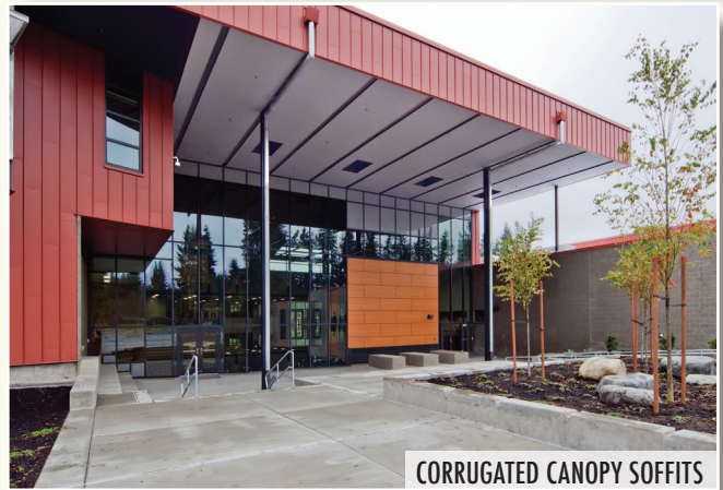
CORRUGATED CANOPY SOFFITS