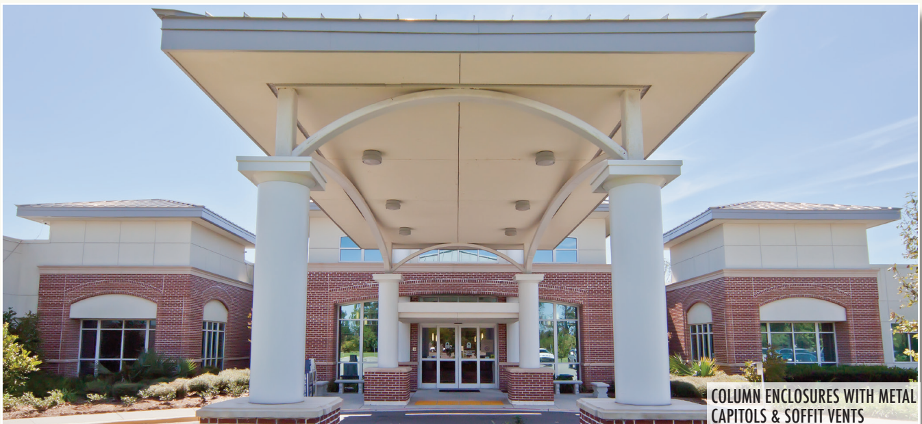
COLUMN ENCLOSURES WITH METAL CAPITALS & SOFFIT VENTS