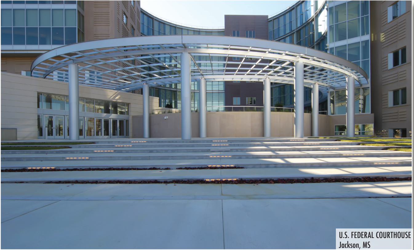
U.S. FEDERAL COURTHOUSE Jackson, MS