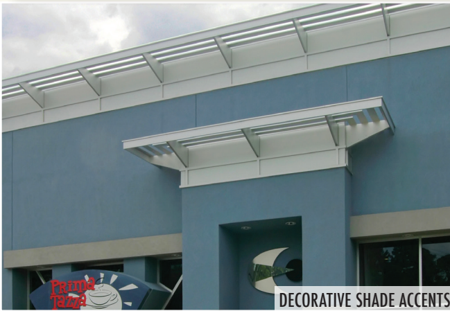
DECORATIVE SHADE ACCENTS