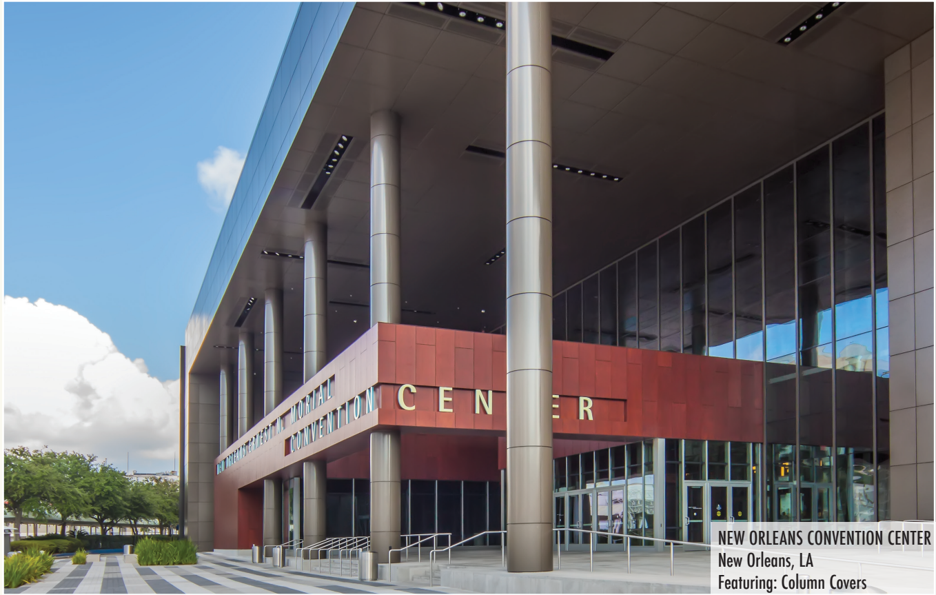
NEW ORLEANS CONVENTION CENTER New Orleans, LA Featuring: Column Covers