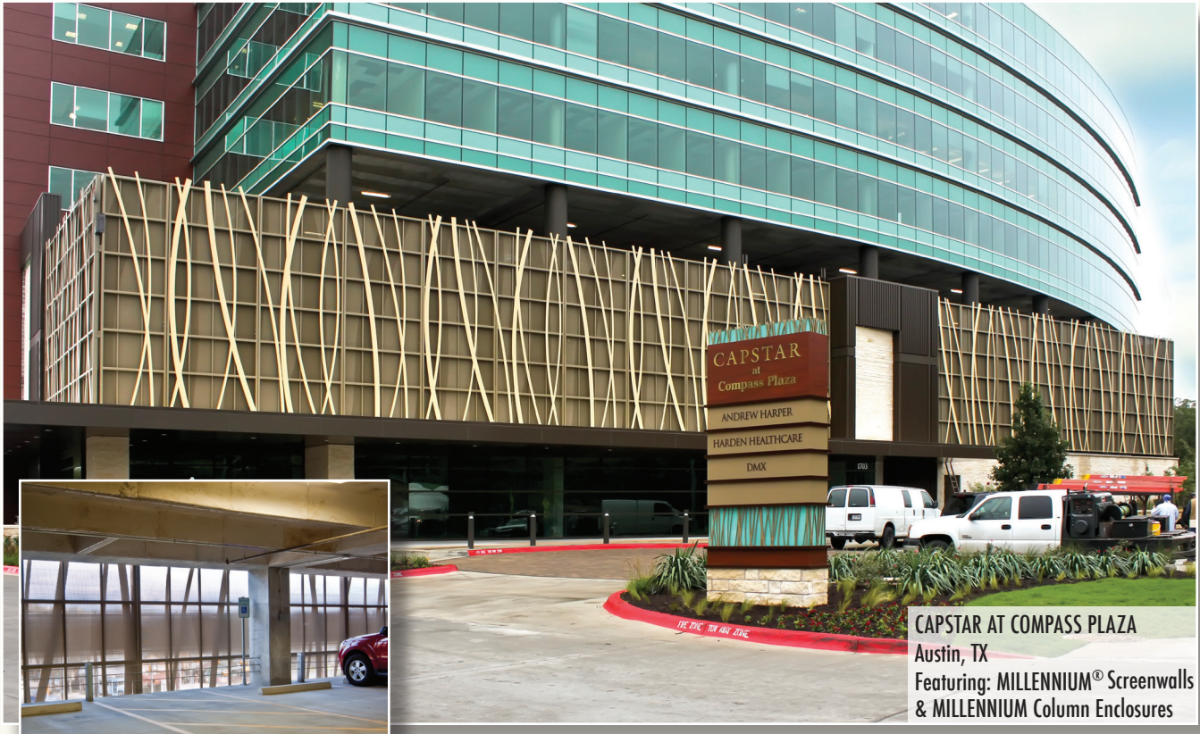
CAPSTAR AT COMPASS PLAZA Austin, TX Featuring: MILLENNIUM® Screenwalls & MILLENNIUM Column Enclosures