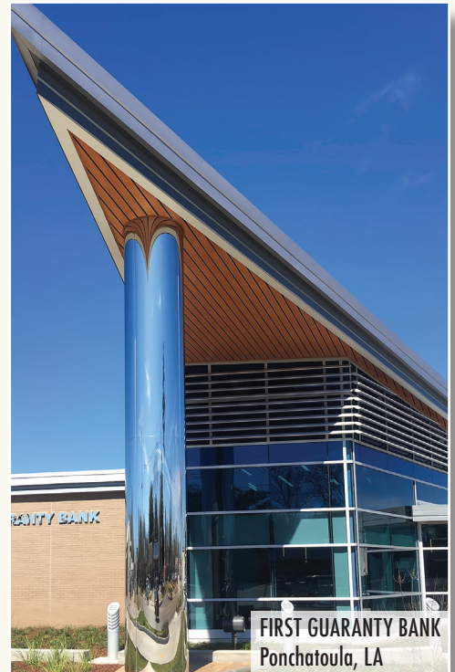
FIRST GUARANTY BANK Ponchatoula, LA