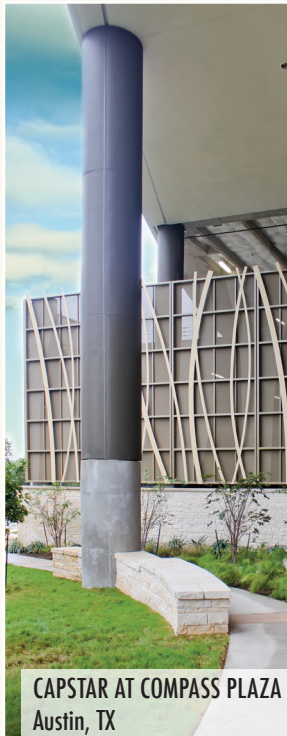
CAPSTAR AT COMPASS PLAZA Austin, TX