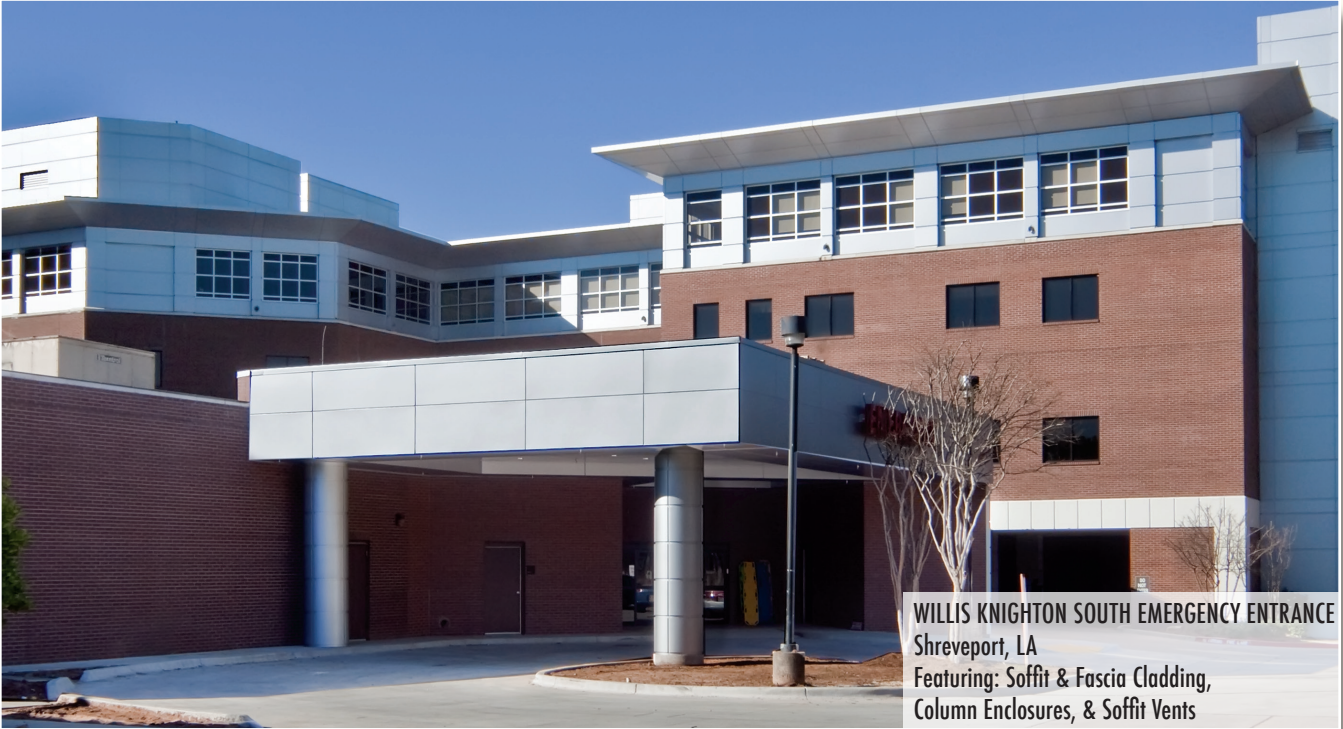
WILLIS KNIGHTON SOUTH EMERGENCY ENTRANCE Shreveport, LA Featuring: Soffit & Fascia Cladding, Column Enclosures, & Soffit Vents