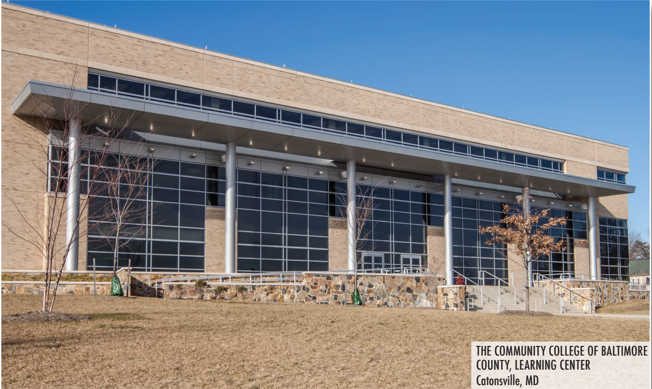
THE COMMUNITY COLLEGE OF BALTIMORE COUNTY, LEARNING CENTER Catonsville, MD