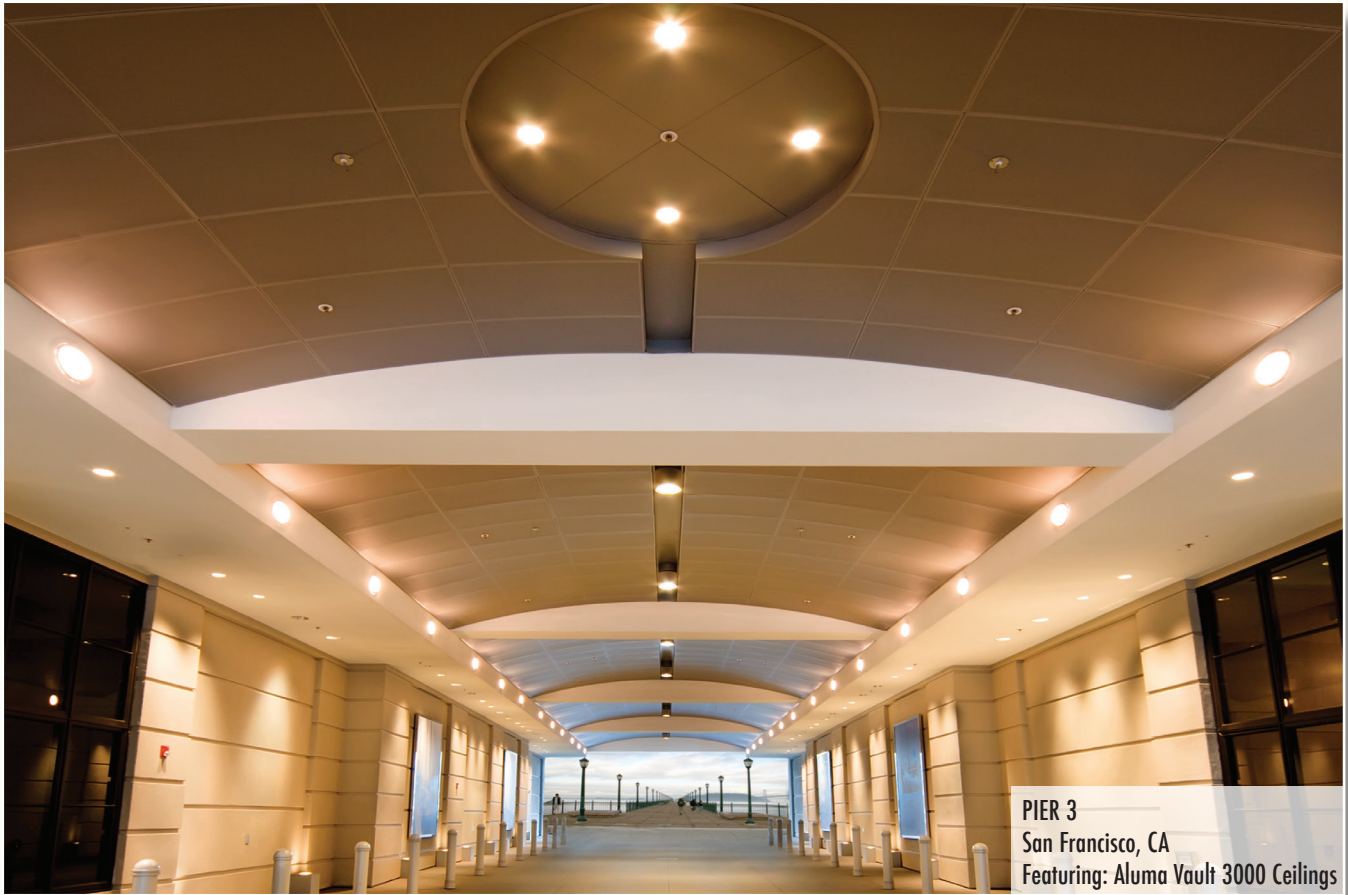
PIER 3 San Francisco, CA Featuring: Aluma Vault 3000 Ceilings