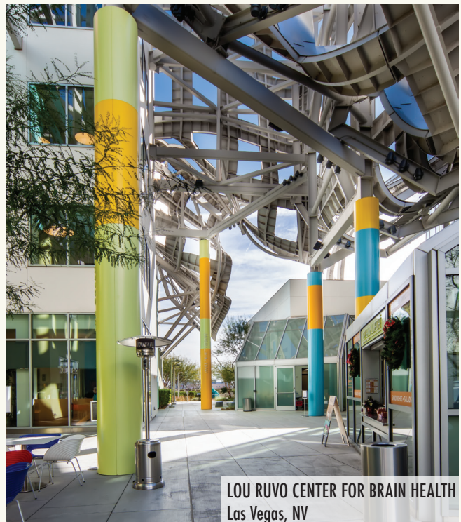
LOU RUVO CENTER FOR BRAIN HEALTH Las Vegas, NV