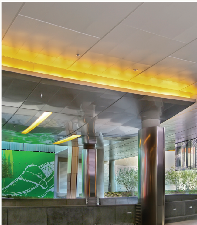
HARMON PLACE AT ARIA RESORT & CASINO, CITYCENTER Las Vegas, NV Featuring: Stainless Steel and Aluminum Canopy Soffits

CISCA Construction Excellence Award Winner