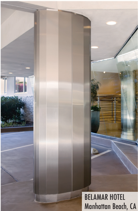
BELAMAR HOTEL Manhattan Beach, CA