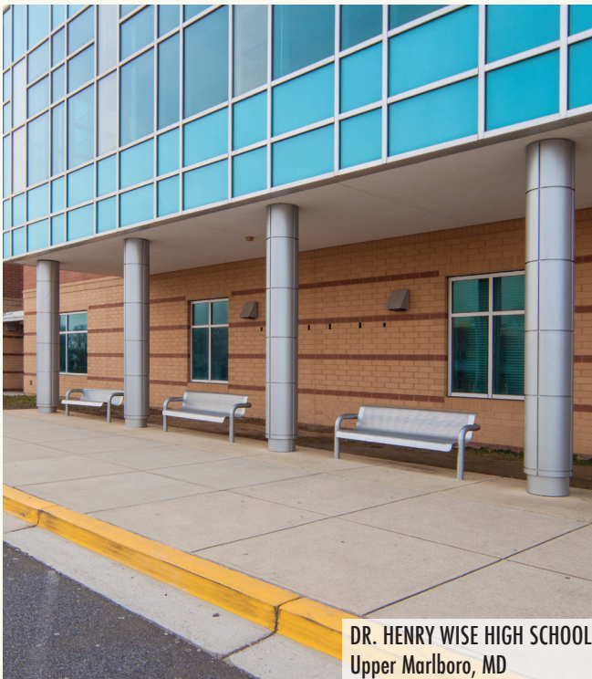
DR. HENRY WISE HIGH SCHOOL Upper Marlboro, MD