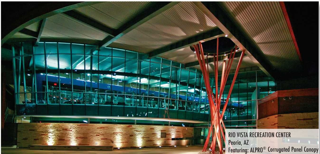
RIO VISTA RECREATION CENTER Peoria, AZ Featuring: ALPRO® Corrugated Panel Canopy