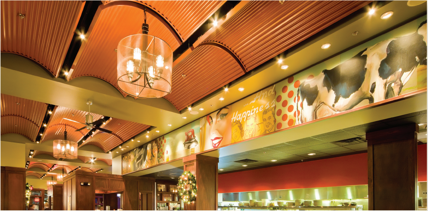
Decorative Vaulted Ceilings with ALPRO Corrugated Lay-in Panels, Curved Perimeter Trims, and Suspension System