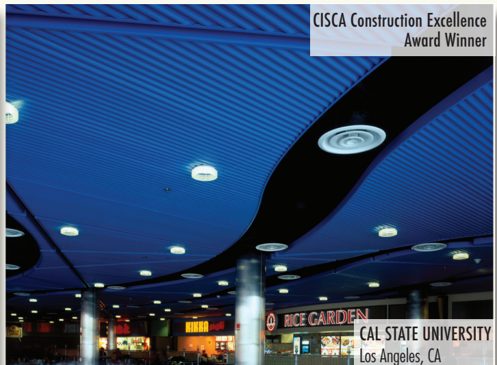
CISCA Construction Excellence Award Winner