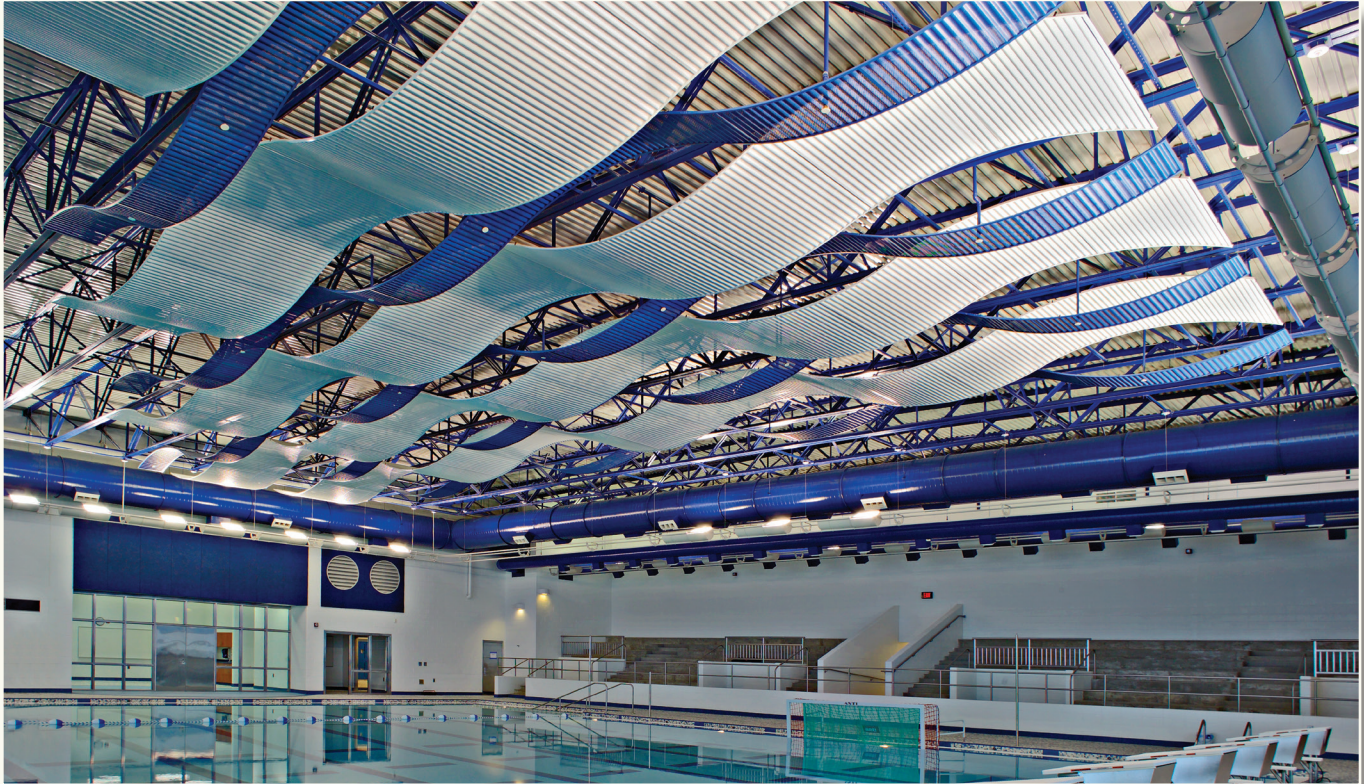
Undulating Ribbon Ceilings Integrating Curved T-Grid Frames with Lay-In ALPRO Corrugated Panels