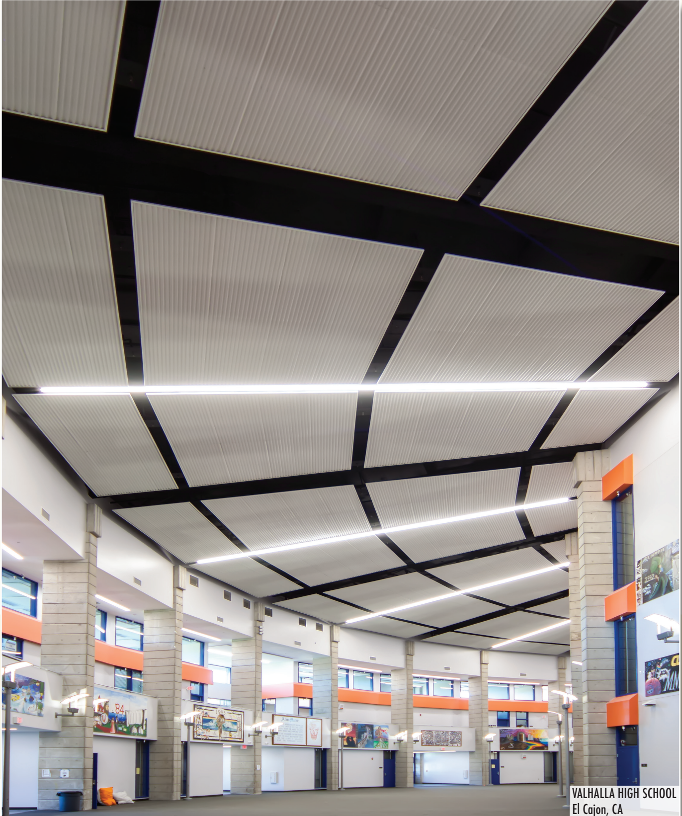
VALHALLA HIGH SCHOOL El Cajon, CA