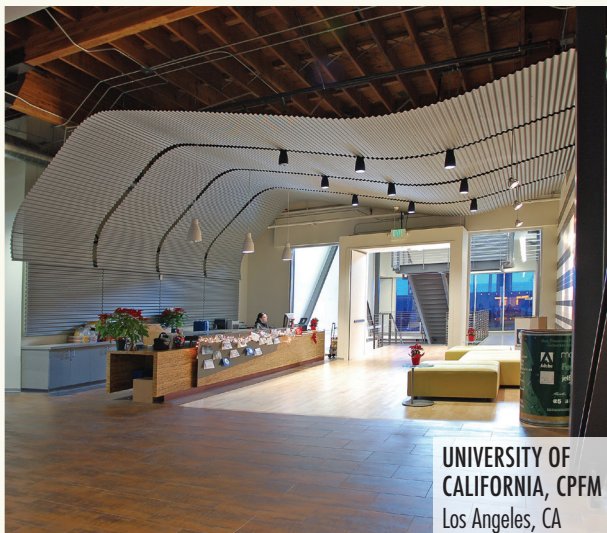
UNIVERSITY OF CALIFORNIA, CPFM Los Angeles, CA

Above and Below - Cloud Ceilings with ALPRO Corrugated Panels and Perimeter Trims, Face-Attached to Concealed Suspension System