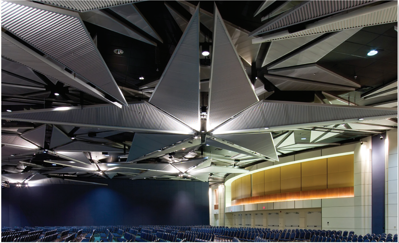
3 Dimensional Star Shaped Clouds with ALPRO Corrugated Panels and Compound Mitered Perimeter Trims, Face-Attached to Concealed Suspension System