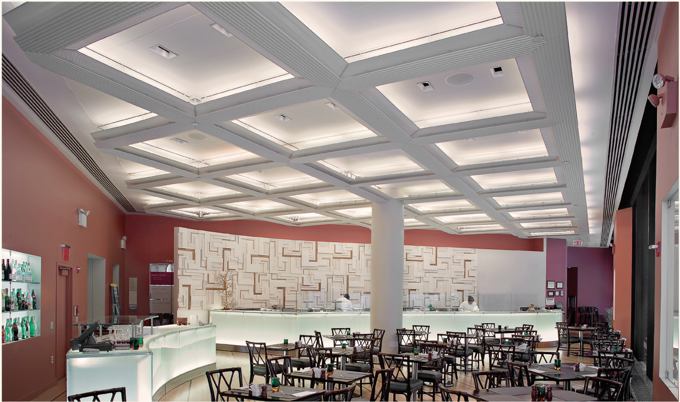
Custom Ceilings with ALPRO Factory Mitered Corrugated Panels and Non-Corrugated Panels featuring Integrated Lights and Sprinklers